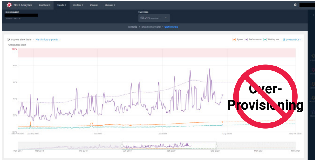
Scale performance and capacity precisely without overprovisioning using predictive analytics